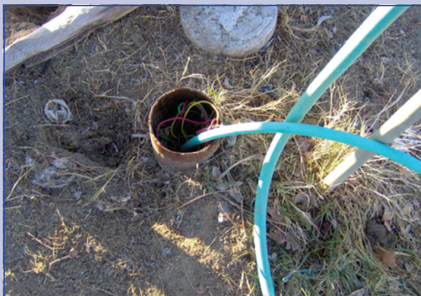
The sanitary cap for this well has been removed and a hose has been inserted to circulate the water and bleach mixture.