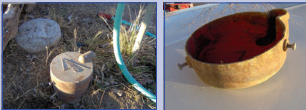
The sanitary cap for a home water supply well, in place (left) and removed (right). The cap can be removed by loosening the screws and lifting the cap off. Always place the cap on a clean surface, away from sources of contamination that could be introduced into the well.